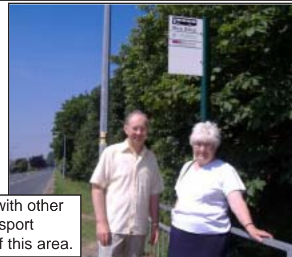
The Parish Council can work with other authorities to improve the transport connections with other parts of this area.