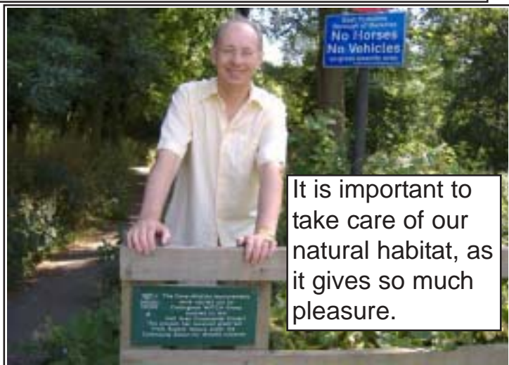
It is important to take care of our natural habitat, as it gives so much pleasure.