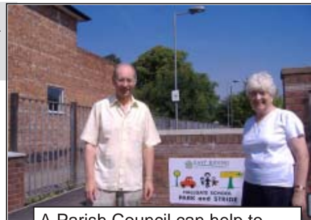
A Parish Council can help to promote facilities that improve life for everyone, young and old.